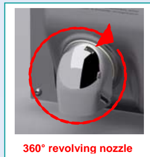
360° revolving nozzle