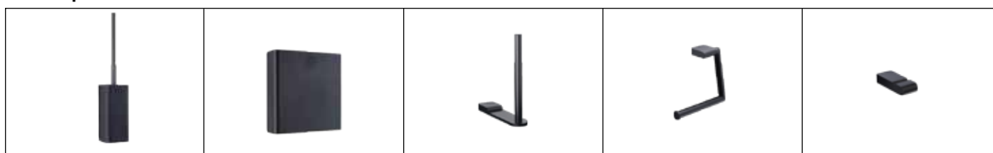
toilet brush holder DP-500