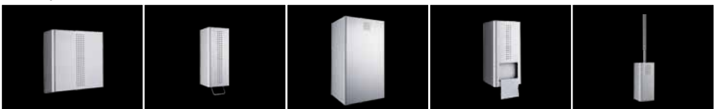
paper towel dispenser PU-100