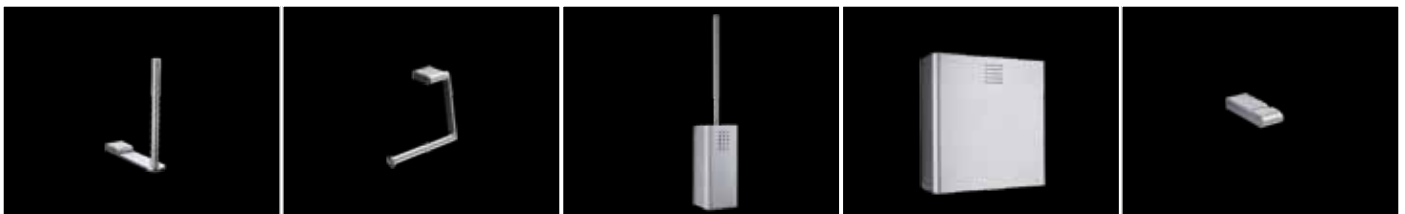
spare roll holder PU-390