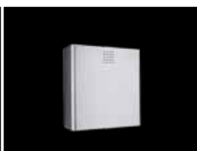
san. napkin disposal bin PU-400