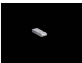
cloth hook PU-560