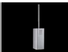
toilet brush holder PU-500