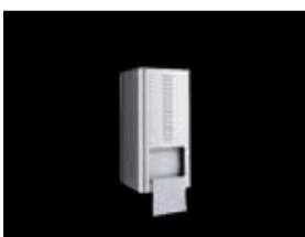
double toilet roll holder DP-300